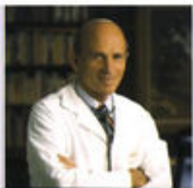
KENNETH H. COOPER, M.D., M.P.H.

Download PDF Online Book Controlling Cholesterol Kenneth H. Cooper Free eBook PDF/ePub/Mobi , This first and only authoritative mass market bestseller on cholesterol contains the most up-to-date, medically sound information on diet, nutrition, exercise and lifestyle--and their impact on coronary problems. Includes the latest information on determining a coronary risk profile, an all-new exercise program, low-cholesterol recipes and more.